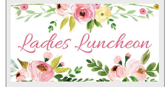
Ladies Luncheon Saturday, September 10 11:00am - 1:00pm

On September 10th, we will host our fifth annual Ladies Luncheon for the mothers and grandmothers of the children of our Lutheran Academy and the ladies of Peace Lutheran Church. The event will be held from 11am-1pm here at Peace. As always, there will be delicious food and time to talk to old friends as well as make some new ones.