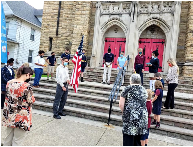
Students and staff gathered around the flag in front of the school on Wednesday, September 22nd.

See You at the Pole™, the global day of student prayer, began in 1990 as a grass roots movement with ten students praying at their school. Twenty years later, millions pray on their campuses on the fourth Wednesday in September.