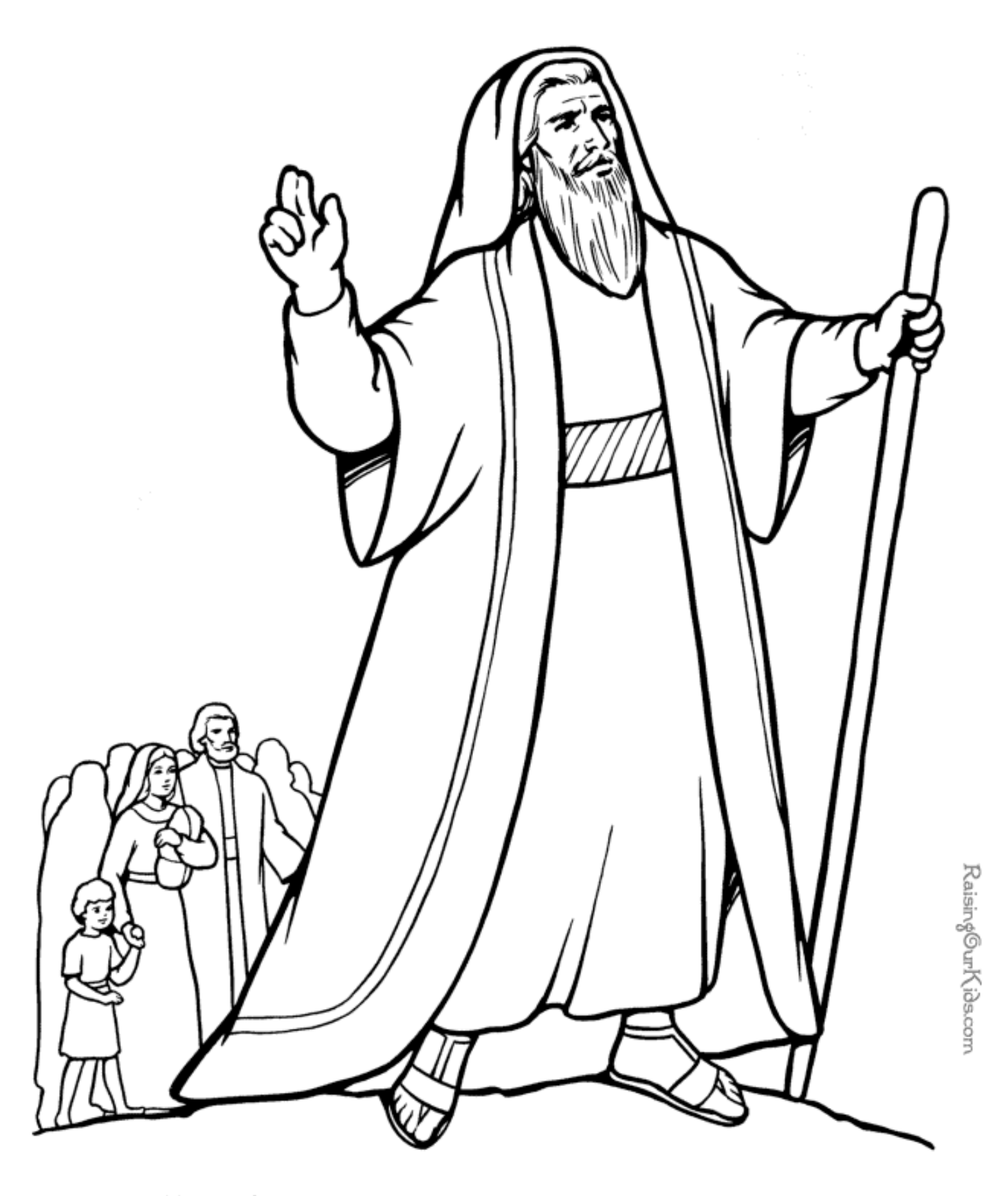
Moses led God's people out of the land of Egypt.